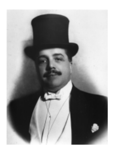
Count Jean de Strelecki Portrait of Serge Diaghilev St Petersburg State Museum of Theatre and Music